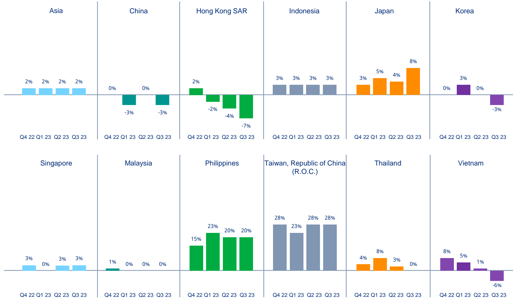
Figure 2| Asia property insurance pricing change by market

Property insurance pricing rose 2% in the quarter.