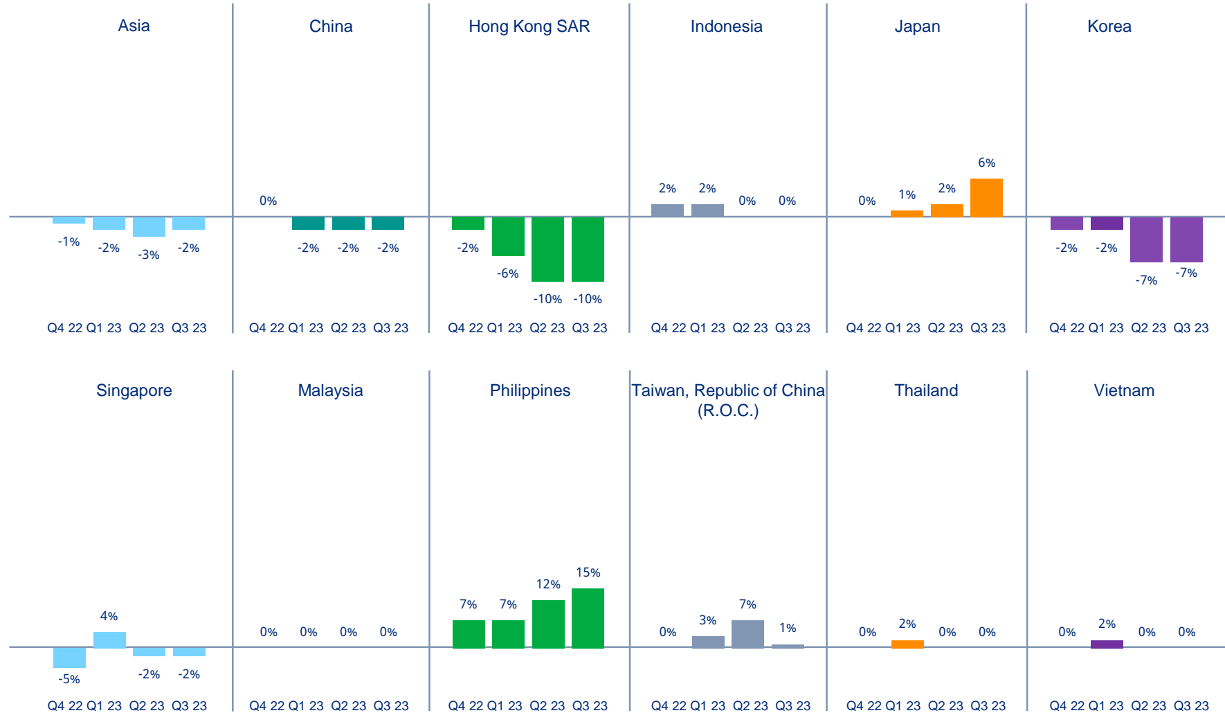
Figure 3| Asia casualty insurance pricing change by market

Casualty insurance pricing declined 2% in the quarter.